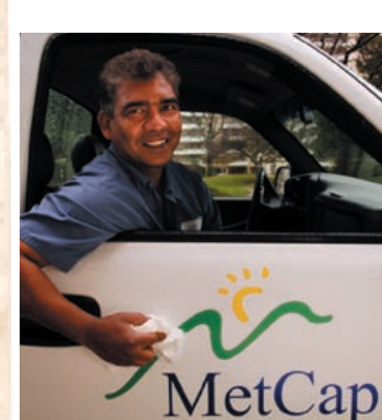
Shah Alam Parkway Forest Community Toronto