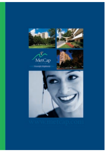
New corporate brochure cover

The organization's branding strategy is well off the starting line and into a full gallop. A new corporate brochure, website and video were unveiled during the May 15th special event. Advertising and promotional initiatives now feature a distinct MetCap Living look and Downright Neighbourly feel. The corporate identity program, which began a couple of years ago, is firmly in place. And new initiatives, that will help to further differentiate MetCap Living