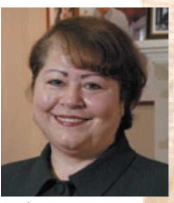
Angela Vani Olympic Village, Montreal