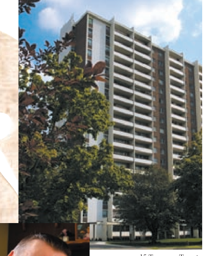
15 Tangreen, Toronto

Other worthy considerations included: The Willow Grove at 100 Parkway Forest Drive, Toronto; The Carlton at 470 Sentinel Drive, Toronto; Garden View Apartments at 321 Sherbourne Street, Toronto; Olympic Village, Montreal; and West Shore Village, Port Perry.