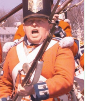
Westshore Village 1812 war re-enactment

Court Justice, the first female appointed to the Canadian