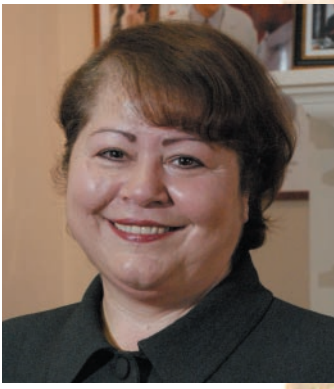
Angela Vani Olympic Village, Montreal