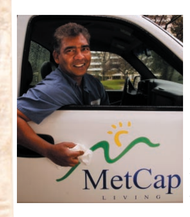
Shah Alam Parkway Forest Community Toronto