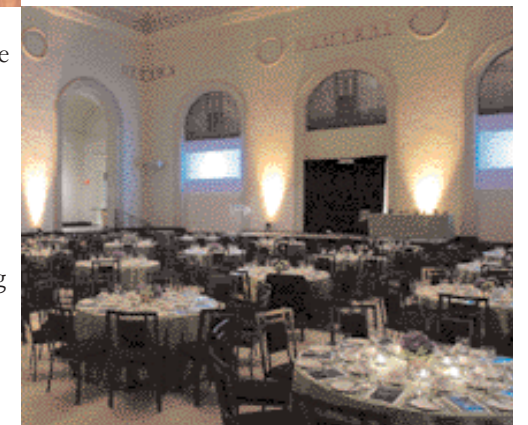
Walkers Court at the Art Gallery of Ontario Home of this year's MetCaptivating Event held on May 20, 2004