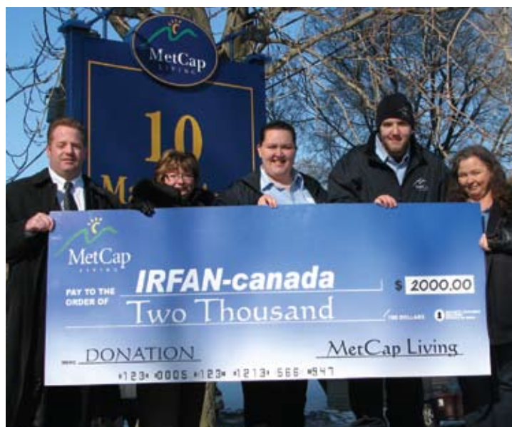
$2000.00 donation to the International Relief Fund for the Afflicted and Needy. Location: 10 Macey Ave.

We hope this money will help to relieve, for even just a few people, the suffering still being experienced in this devastated area.