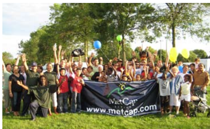
Annotation required for this photo...

the police department also came out to celebrate at this family event and to demonstrate their presence in the neighbourhood. Food and non-alcoholic drinks were provided, along with prizes for children and door prizes for other participants.