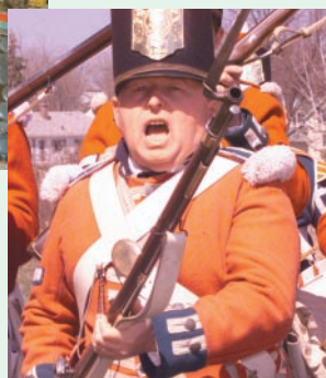
Westshore Village 1812 war re-enactment

Home in Etobicoke who quietly stickhandled their way through a flood that left the facility evacuated for 2 months. Residents, who were billeted at nearby facilities, were very happy to finally return home...Over in Port Perry, the Community Advisory Board and staff at West Shore Village hosted a War of 1812 re-enactment that attracted an impressive local crowd and raised money for the Lakeridge Health Centre .