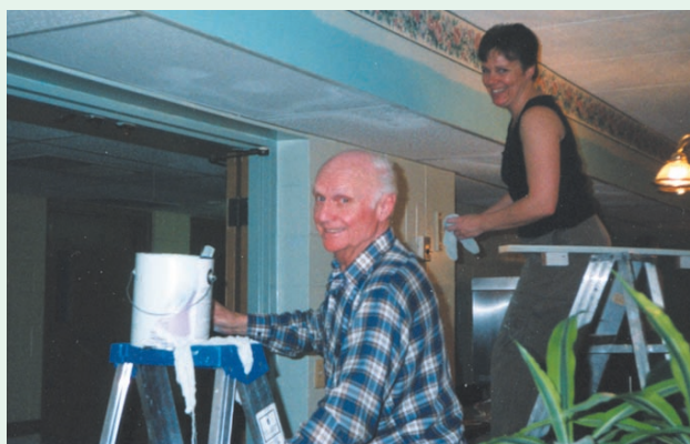
MetCap Living staff and resident family members shared pizza, pop and paintbrushes at Parkview Nursing Home in Hamilton during a recent painting party.