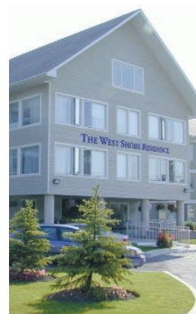
West Shore Village