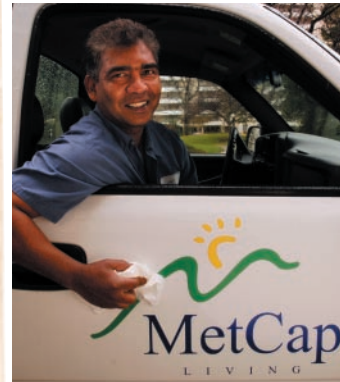
Shah Alam Parkway Forest Community Toronto