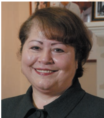
Angela Vani Olympic Village, Montreal