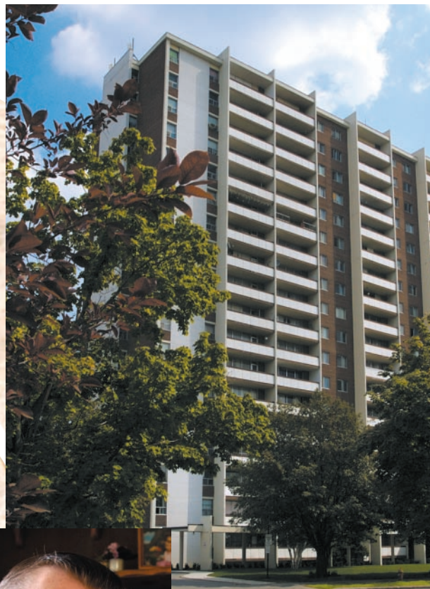
15 Tangreen, Toronto

Other worthy considerations included: The Willow Grove at 100 Parkway Forest Drive, Toronto; The Carlton at 470 Sentinel Drive, Toronto; Garden View Apartments at 321 Sherbourne Street, Toronto; Olympic Village, Montreal; and West Shore Village, Port Perry.