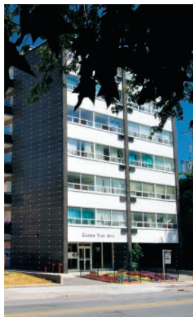
Garden View Apartments